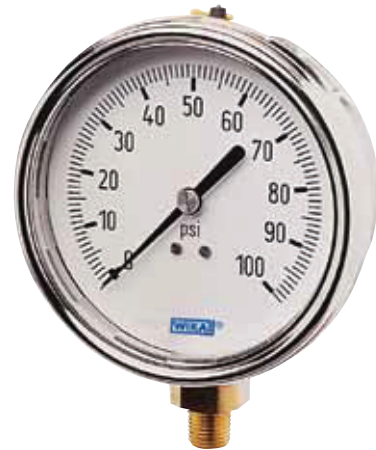
Bourdon Tube Pressure Gauge Model 212.54, 4"

Ambient: -40°F to +140°F (-40°C to +60°C) - dry -4°F to +140°F (-20°C to +60°C) - glycerine filled -40°F to +140°F (-40°C to +60°C) - silicone filled Medium: +140°F (+60°C) maximum