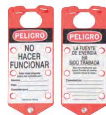
Legend Option 3