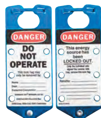
Legend Option 1