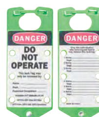
Legend Option 2